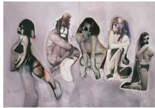
Richard Prince, James Brown Disco Ball